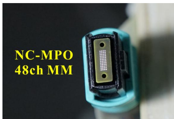
Figure 1. 48 channel multimode NC-MPO fiber connector has a visible AR coating

which avoids the direct contact of the fiber end face and solves the problem of simultaneous fiber connection. The working pressure can be small. However, due to the introduction of more optical elements in the optical path, EBC greatly increases complexity and cost, and has poor optical performance. Multimode fiber insertion loss is as high as 1.2dB, and it is not even suitable for single mode fiber at all.